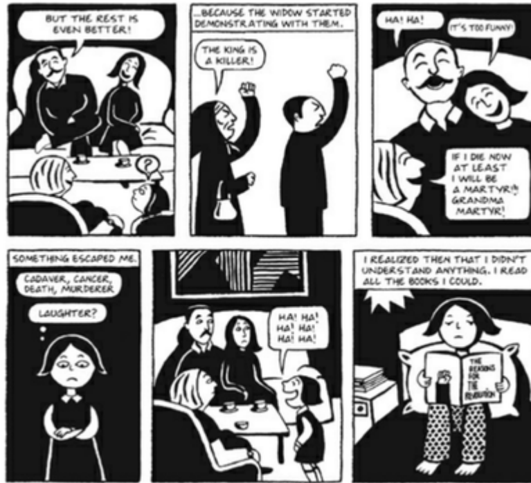
Page 36, Last 6 panels