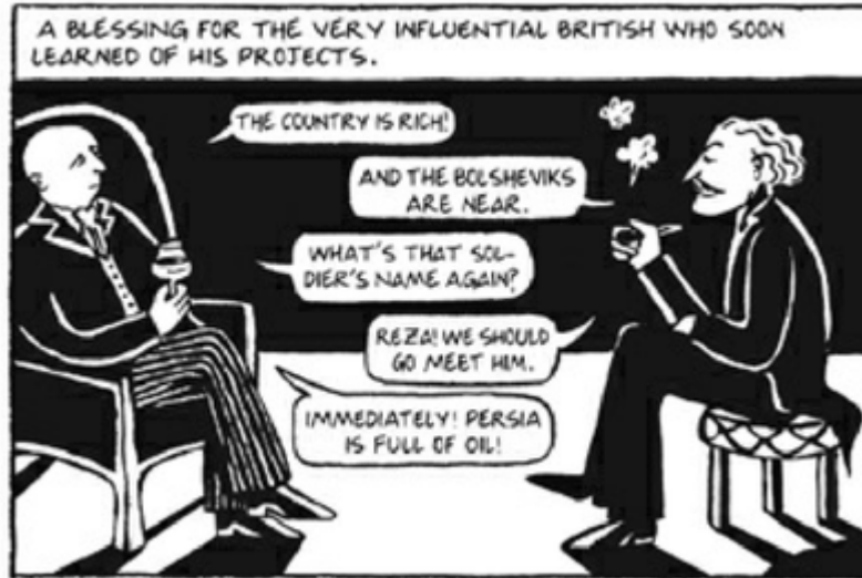
Page 24, Panel 6